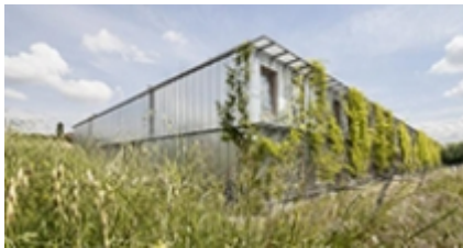
↘ H Arquitectes, Sabadell