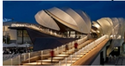
↘ SCHMIDHUBER, München