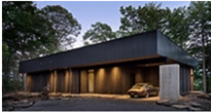
↘ Barry Price Architecture, Bearsville