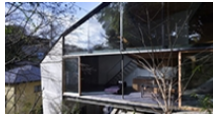
↘ Suppose Design Office, Hiroshima